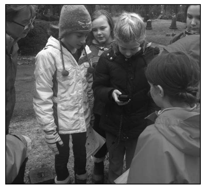
At Newton Cemetery, charting coordinates with GPS.

Through their efforts, the members of the Plant A Smile 4-H Club have contributed to the preservation of the memory of Newton's participation in the War of the Rebellion using a combination of nineteenth-century historic resources and twenty-first century technology. They have now made