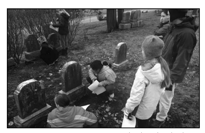
At Newton Cemetery, using monuments to gather data.