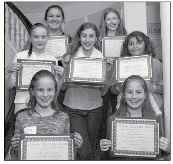
Plant A Smile 4-H Club members with their Historic Newton Preservation Awards.

buying a GPS device, they went on a field trip to Harvard University's Arnold Arboretum. The arboretum had been using the same ArcGIS software to map their collection of trees and was able to provide training on the software.